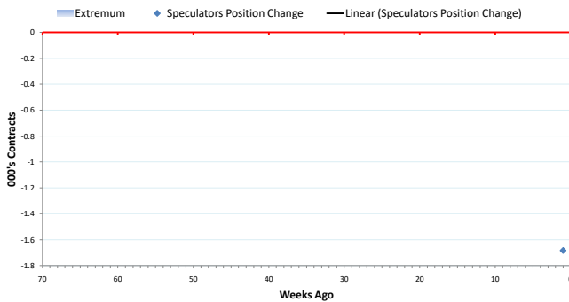
Bullish and Bearish Zones - Chart

Regression Analysis Market is in the early stages of a zone, need more data