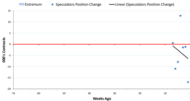
Bullish and Bearish Zones - Chart

Confidence We see current market confidence as Low. Speculators index is out of extreme area by 24 points. Accumulation Distribution During this week Speculators sold 17004 contracts. This was highest distribution during current bearish zone. Speculators distributed 5 of 7 weeks. This distribution accounts for 44.2% distributed so far.